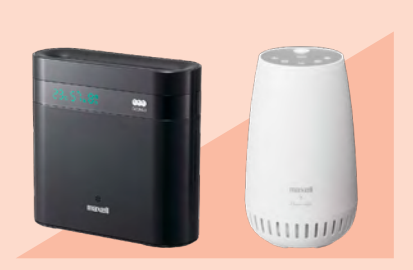
Ozone anti-bacterial deodorizer